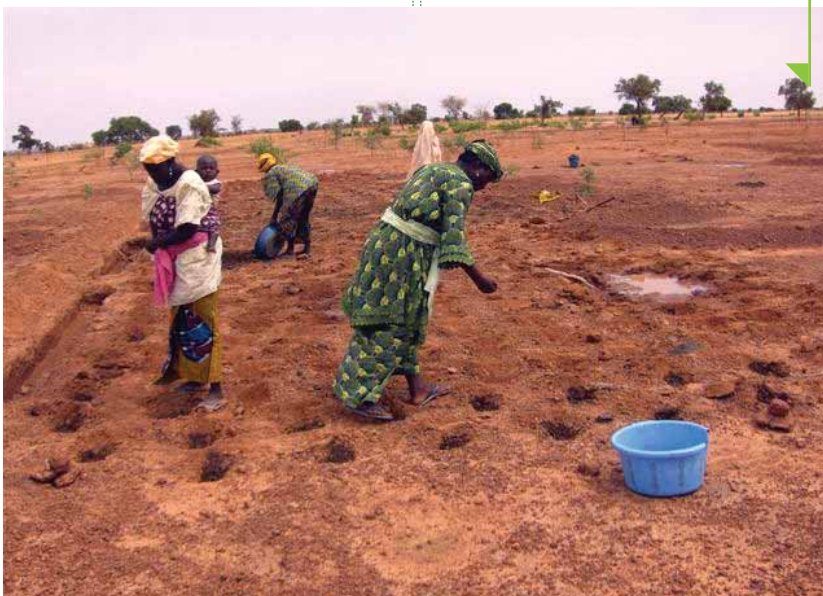
Farmers placing manure in zai pits in Niger.

For over 30 years, the International Center for Agricultural Research in the Dry Areas (ICARDA) has focused on dry areas and, in particular, on helping farmers cope with climate variability. ICARDA is now tackling climate change issues more broadly, with greater emphasis on adaptation, mitigation and ecosystem resilience.