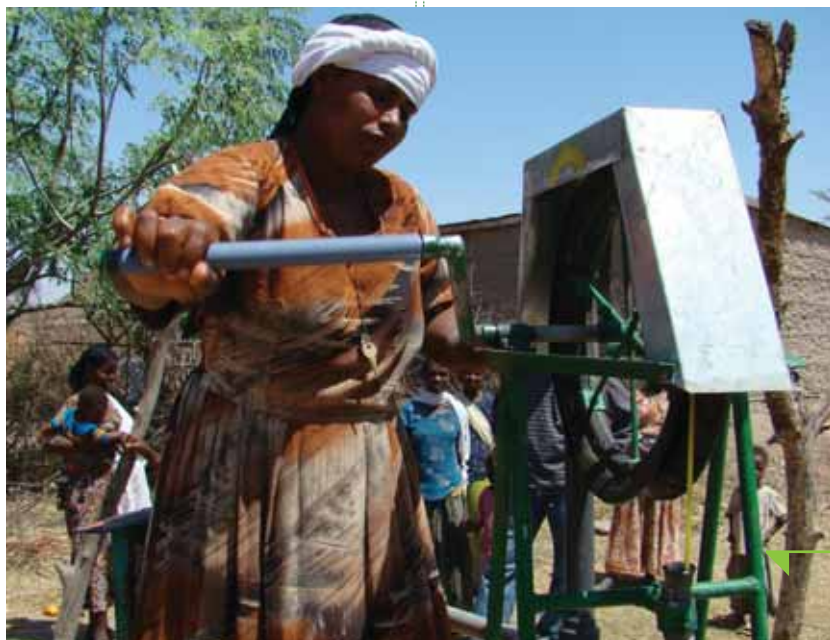
This farmer Ziway, Ethiopia, uses a rope pump to access water to irrigate her small plot.

Opportunities to enhance productivity of both irrigated and rainfed lands will be examined as part of the project. Research suggests that, in many parts of South Asia and SSA, doubling or even quadrupling rainfed crop yields is